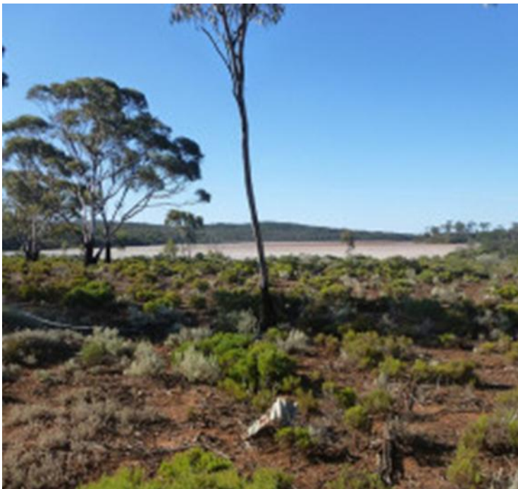
National Seniors Australia (NSA)

I am from the land of ancient rocks And the spirits that walk upon them The brilliant stars at night The heat of summer and the frosts of winter All this is part of who I am