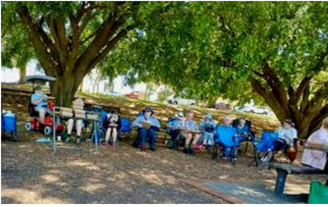
A small section of the group enjoying their lunch under the ancient fig trees.