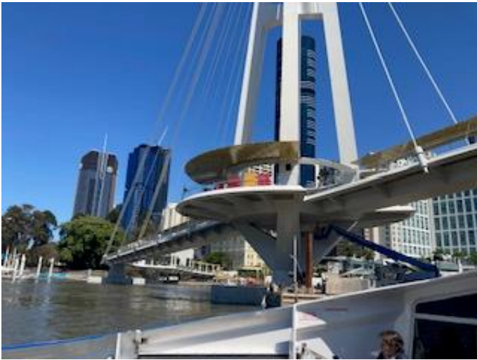
Brisbane's newest foot bridge from The Gardens to Kangaroo Point nears completion.