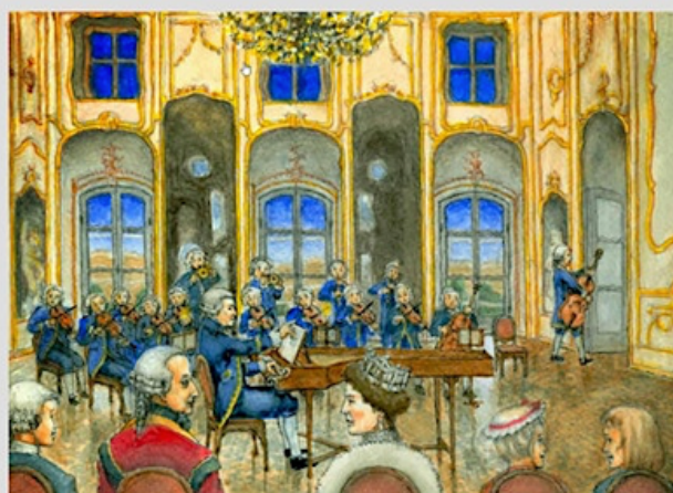
Off walks the Cellist..... Farewell Symphony Premiere, 1784;